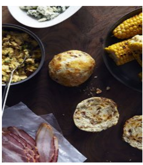
Download the recipe for Bacon Biscuits with Jalapeno Scrambled Eggs