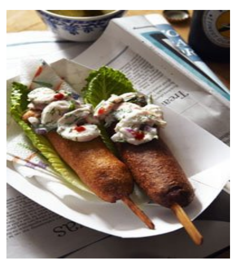
Download the recipe for Swede Doggy Dogs with Shrimp Salad