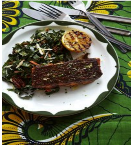
Download the recipe for Dill-Spiced Salmon