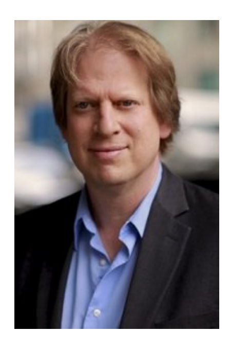
Q) What's up with the title?

A) It's meant to be playful, because it has two quite different meanings. Just Babies can express a reasonable skepticism about the abilities of these tiny creatures—what do you expect of them, they're just babies? But of course "just" also derives from justice—as in "a just society"—and so the title captures one of the main arguments of the book, which is that we are born as moral creatures. We start off as just babies. I know this sounds like a remarkable claim, but I hope that my book will convince people to take it seriously.